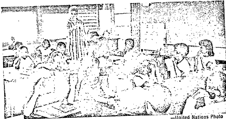
Children in the Marianas have been taught in American-style schools since World War II, adding to area's ties with U. S.

Negotiators say that union could be accomplished as early as 1974 if all hurdles are removed—in the Marianas legislature, the U. S. Congress, the United Nations, and a plebiscite of the island people.