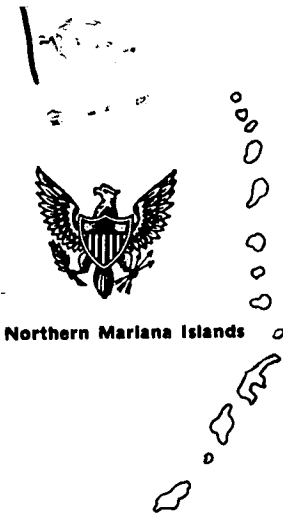
Northern Mariana Islands