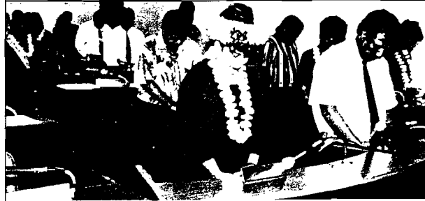
Prayer at beginning of Con-Con session