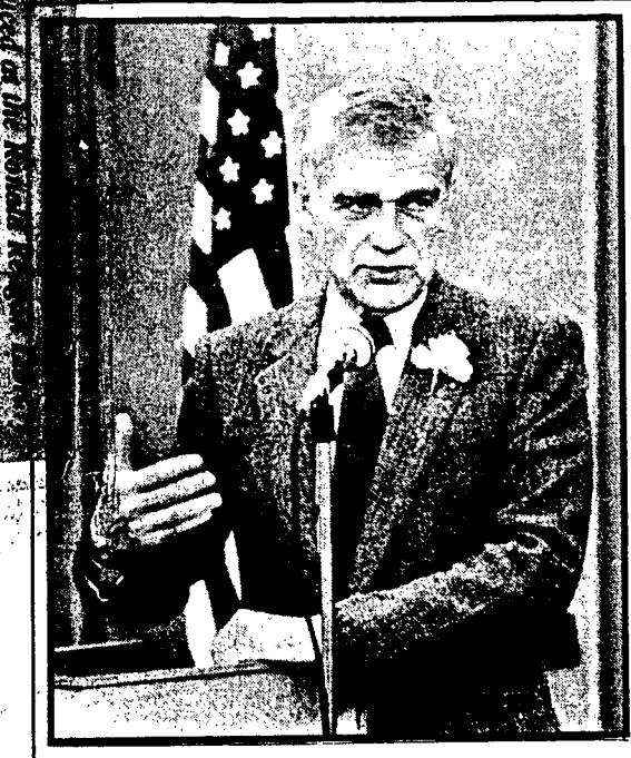
Senator Hatfield accepts Advisory Board position. "Healthy governments are built by tending people's health and hunger needs."